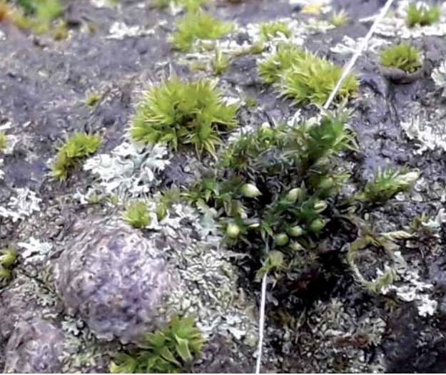
△ Figure 1. Orthotrichum schimperi maturing under dental floss. Sean O'Leary