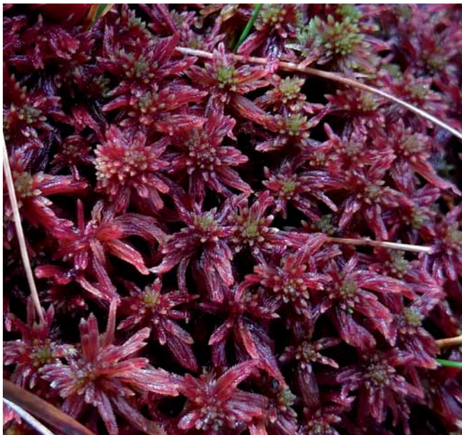
▽ Figure 6. Sphagnum warnstorffii in Co. Clare. Rory Hodd