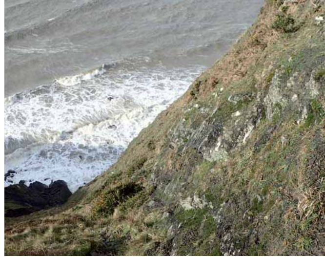
△ Figure 3. Habitat of Tortula cuneifolia in Cardiganshire. Matt Sutton

on her own and with friends, when it was safe to do so. As a result, no fewer than nine mosses have been added or restored to Breconshire, including Ulota intermedia and Didymodon icmadophilus , the latter from one of its usual haunts on a forestry track.