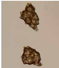
▽ Figure 2. Pohlia flexuosa bulbils. Sharon Pilkington

Blindia acuta . Exmoor was quite well surveyed in the 1990s (Perry, 2001) making this all the more remarkable.