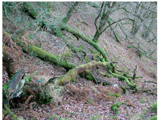
▼ Gwenffrwd-Dinas RSPB reserve, Carmarthenshire, 2003. Sam Bosanquet

Diocious; often fertile; sporophytes are occasional, March to August. Gemmae are common.